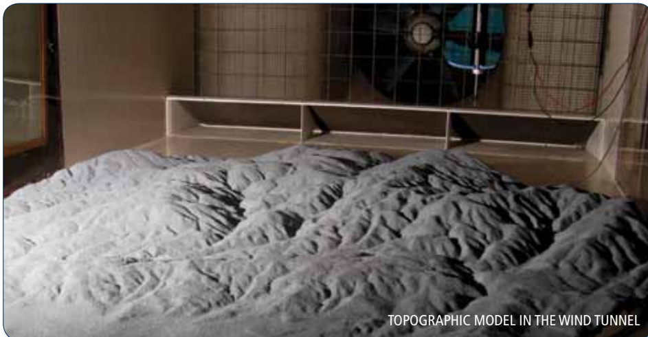
TOPOGRAPHIC MODEL IN THE WIND TUNNEL