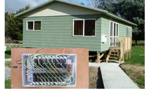
Determining the best ventilation strategy for New Zealand homes

One of the programme's goals is to provide a performance basis for weathertight design and seeks to improve indoor environments, helping to avoid future issues resulting from changes to designs, materials and construction methods.