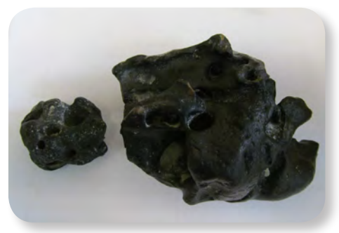
ROCK PHOSPHATE NODULES